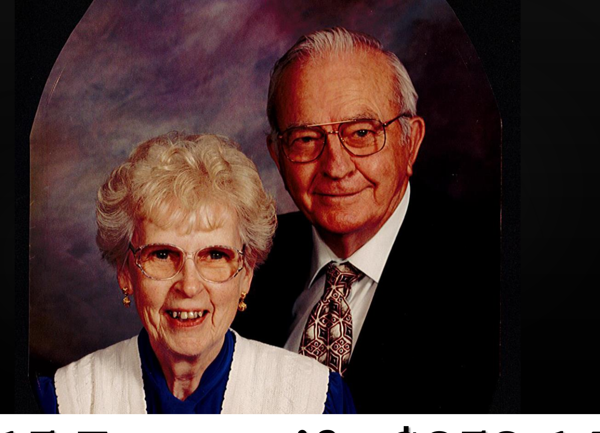
2015 Estate gift: $358,147