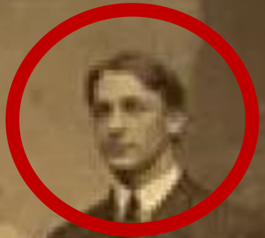
OHIO WESLEYAN BASEBALL TEAM